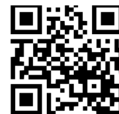
QR code Inmartech 2016