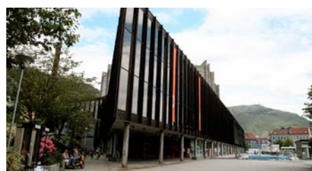
Meeting venue: Grieghallen