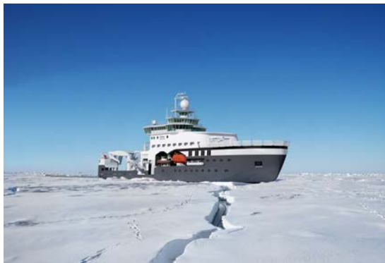
Kronprins Haakon (Fincantieri, Italy)