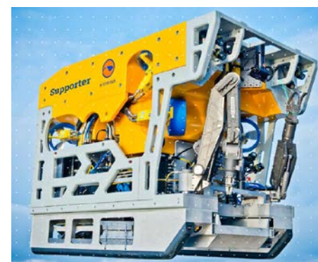
NORMAR ROV "Ægir 6000" (ROV: Kystdesign, Norway, Winch: Sepro, Denmark)